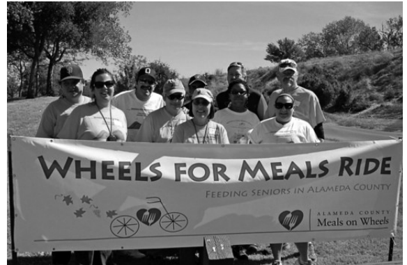
Wheels for Meals Ride staff and volunteers - We couldn't have done it without you!

"The volunteers at the last rest stop were GREAT. Very friendly, gracious and SPIRITED! Just what we needed nearing the end of a challenging ride."